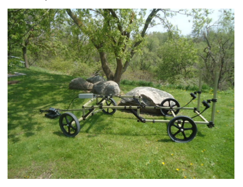
This image of a cart-borne system shows a simple 2 sensor array in operation.

Sensor X4 is located at a different level than the other sensors in order to derive the 3D vertical gradient. Output values are determined automatically using the GEM system console.